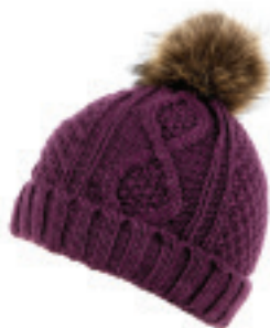
KELLY HAT PLUM