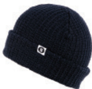
BRADLEY HAT NAVY