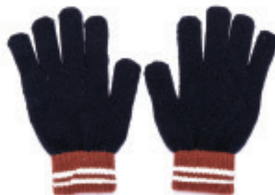
RUSSELL BLACK CAMEL GLOVE