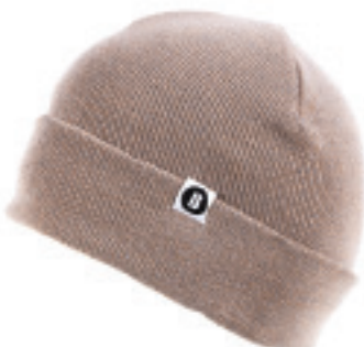
NATHAN HAT CAMEL

BOARDMANS' FORWARD THINKING DESIGN TEAM CONSISTENTLY CREATE SELL OUT PRODUCT LINES.