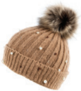
CARLA HAT CAMEL