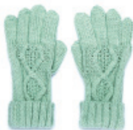
KELLY GLOVE MINT