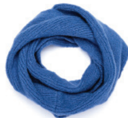
PENNY SNOOD COBALT