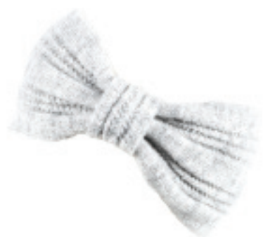
MADDY HEADBAND GREY