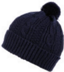
EDWARD NAVY HAT