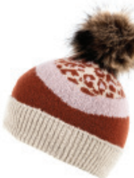
MELODY HAT CAMEL/RUST/PINK