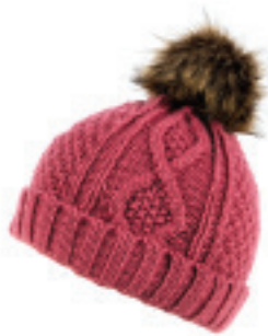
KELLY HAT RASPBERRY