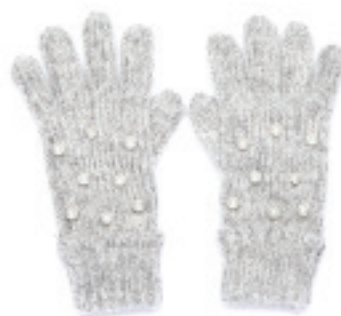
SANDY GLOVE GREY