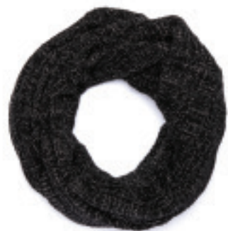
MADDY SNOOD BLACK