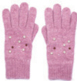
CARLA GLOVE LILAC