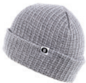
BRADLEY HAT GREY