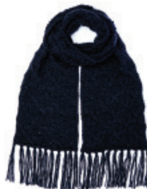
BELLA SCARF NAVY