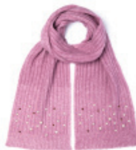
CARLA SCARF LILAC

WE INVEST IN MARKET INTELLIGENCE AND TREND PREDICTION, THEN CONVERT THOSE MARKET INSIGHTS INTO PRODUCTS THAT SELL.