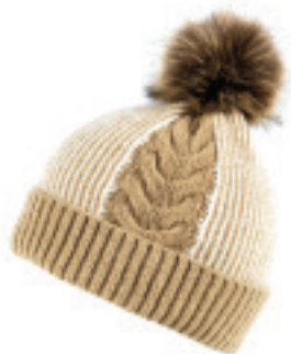
NINA HAT CAMEL