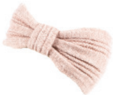
MADDY HEADBAND PINK