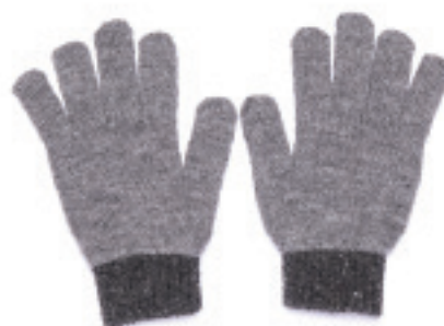
DOUG GREY GLOVE