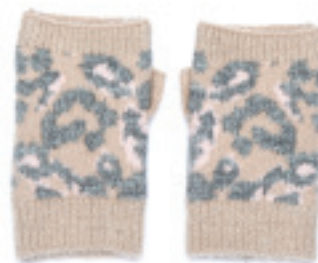
MELODY MITT CAMEL/GREY/PINK

AVAILABLE IN Camel/Grey/Pink, Camel/Rust/Pink