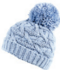
BELLA HAT POWDER BLUE