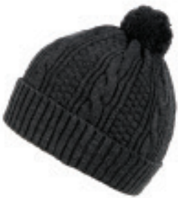
EDWARD GREY HAT