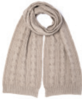
EDWARD CAMEL SCARF