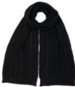
EDWARD BLACK SCARF