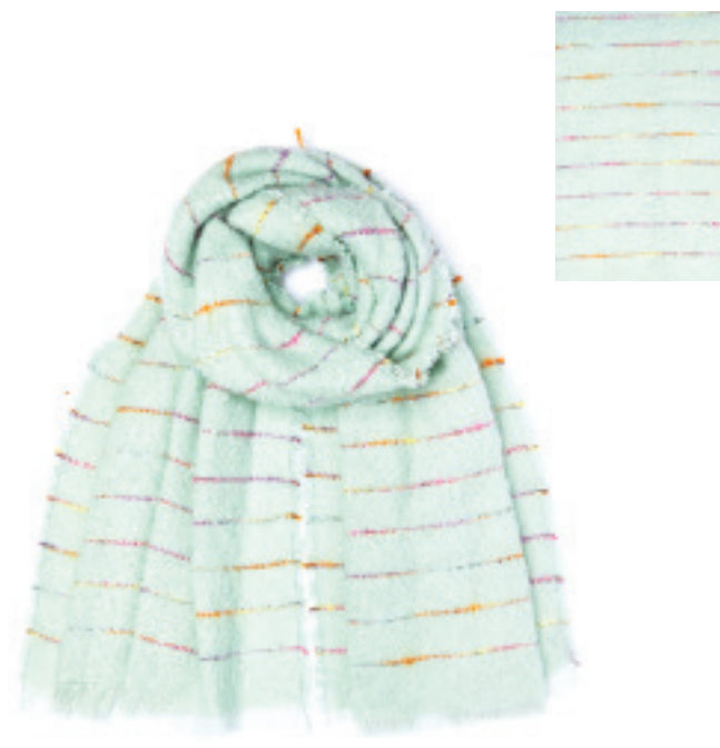
BELLE SCARF MINT