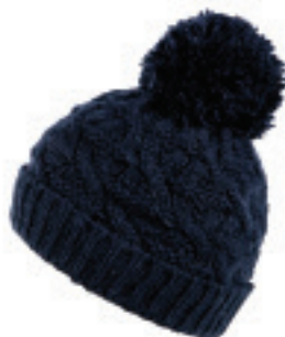
BELLA HAT NAVY