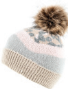
MELODY HAT CAMEL/GREY/PINK

AVAILABLE IN Camel/Grey/Pink, Camel/Rust/Pink