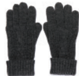
EDWARD GREY GLOVE