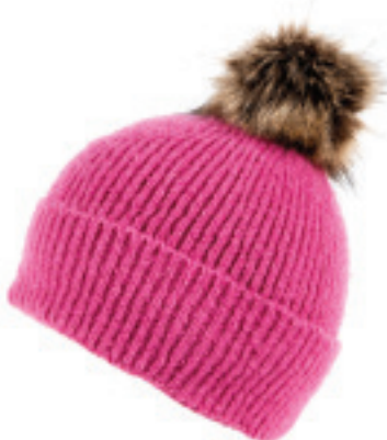
PENNY HAT PINK

Black, Navy, Raspberry, Ochre, Blue, Grey, Dusty Pink