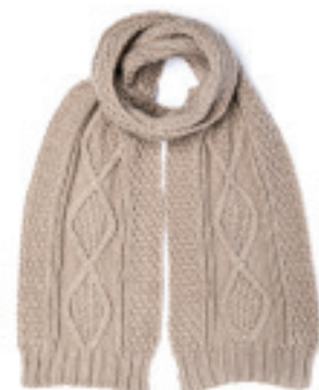
KELLY SCARF OATMEAL