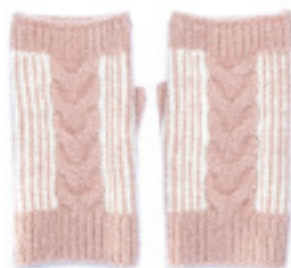
NINA MITT PINK