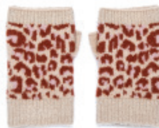
MELODY MITT CAMEL/RUST/PINK