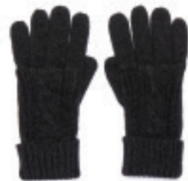
EDWARD BLACK GLOVE