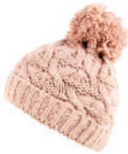
BELLA HAT BABY PINK