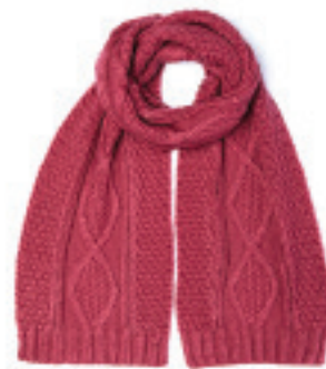
KELLY SCARF RASPBERRY

Black, Grey, Raspberry, Rust, Plum, Oatmeal, Mint