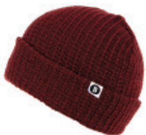
BRADLEY HAT RUST