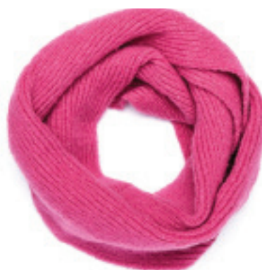
PENNY SNOOD PINK