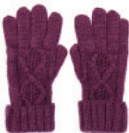
KELLY GLOVE PLUM