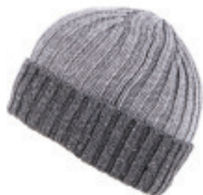
DOUG GREY HAT