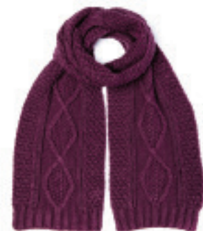
KELLY SCARF PLUM