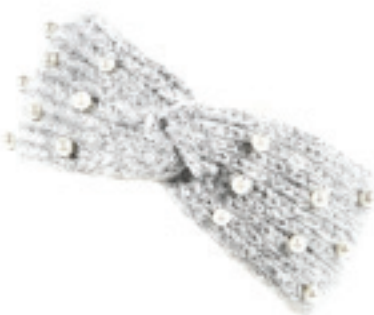
SANDY HEADBAND GREY