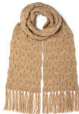
BELLA SCARF CAMEL