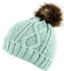
KELLY HAT MINT

Black, Grey, Raspberry, Rust, Plum, Oatmeal, Mint