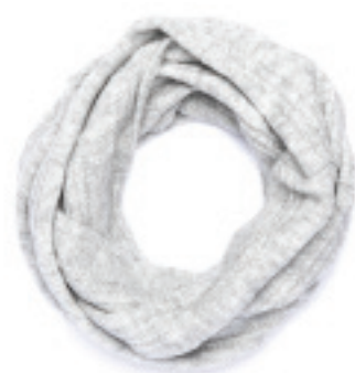
MADDY SNOOD GREY