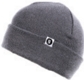
NATHAN HAT GREY