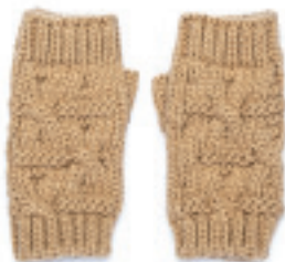
BELLA MITT CAMEL