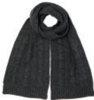
EDWARD GREY SCARF