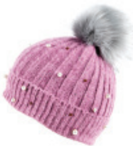
CARLA HAT LILAC