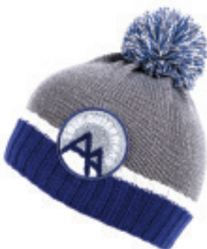
RUSSELL GREY COBALT HAT