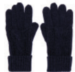
EDWARD NAVY GLOVE