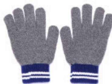
RUSSELL GREY COBALT GLOVE