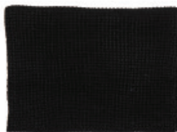
BRADLEY SNOOD BLACK