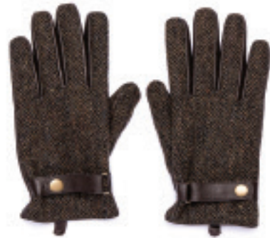
HARRIS TWEED GREEN GLOVE

AVAILABLE IN Black Tweed, Green Tweed, Blue Tweed