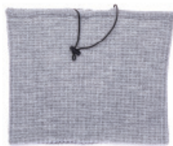
BRADLEY SNOOD GREY