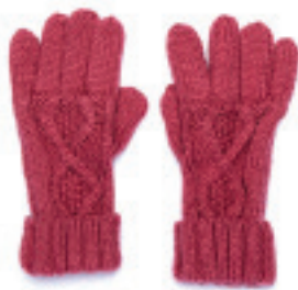
KELLY GLOVE RASPBERRY