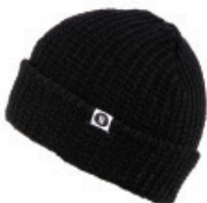
BRADLEY HAT BLACK