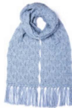
BELLA SCARF POWDER BLUE