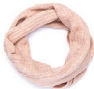
MADDY SNOOD PINK