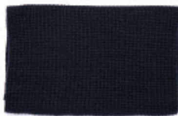
BRADLEY SNOOD NAVY