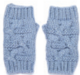
BELLA MITT POWDER BLUE