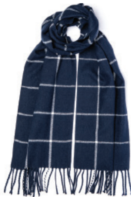
EVAN SCARF NAVY