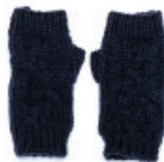
BELLA MITT NAVY