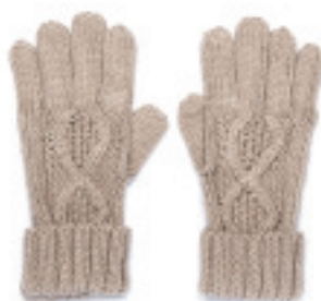
KELLY GLOVE OATMEAL