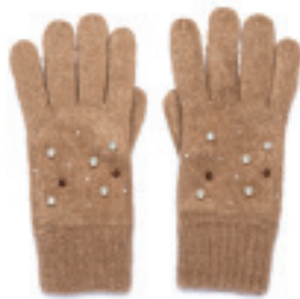
CARLA GLOVE CAMEL