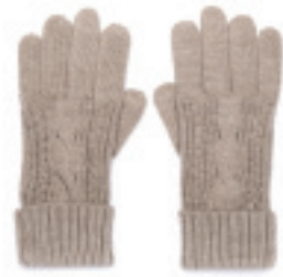
EDWARD CAMEL GLOVE