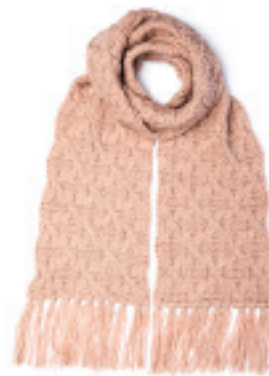
BELLA SCARF BABY PINK