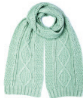
KELLY SCARF MINT