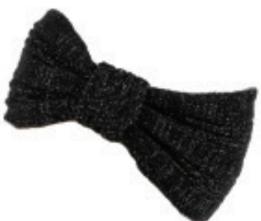
MADDY HEADBAND BLACK