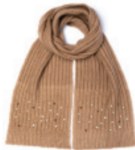
CARLA SCARF CAMEL