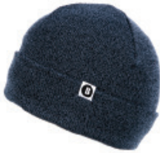
NATHAN HAT BLUE