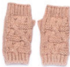
BELLA MITT BABY PINK