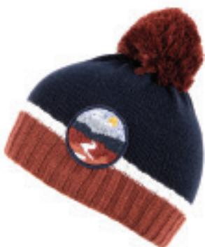
RUSSELL BLACK CAMEL HAT