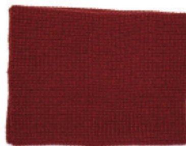
BRADLEY SNOOD RUST