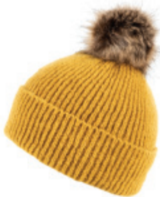
PENNY HAT OCHRE