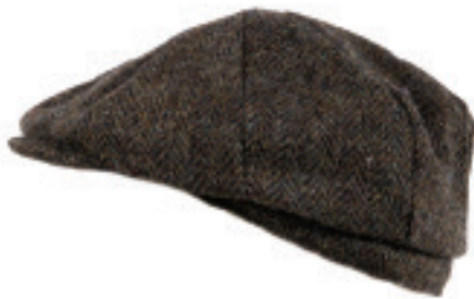
HARRIS TWEED GREEN BAKERBOY

AVAILABLE IN Black Tweed, Green Tweed, Blue Tweed