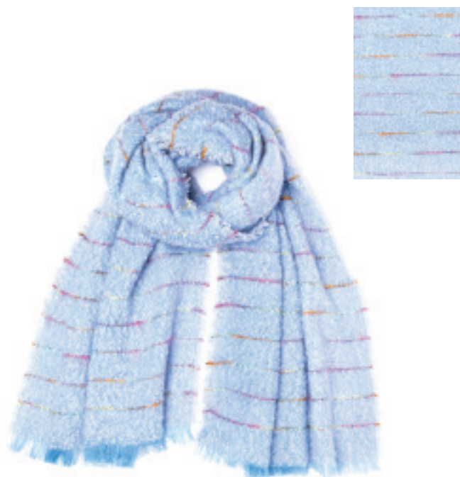
BELLE SCARF BLUE