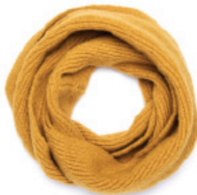
PENNY SNOOD OCHRE

Black, Navy, Raspberry, Ochre, Blue, Grey, Dusty Pink