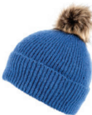
PENNY HAT COBALT