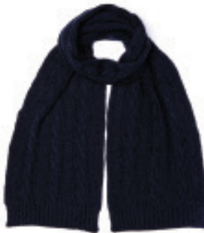
EDWARD NAVY SCARF