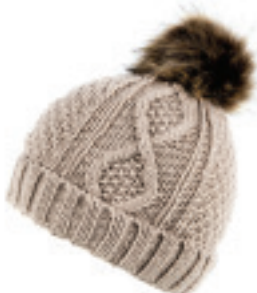
KELLY HAT OATMEAL