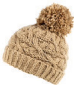
BELLA HAT CAMEL